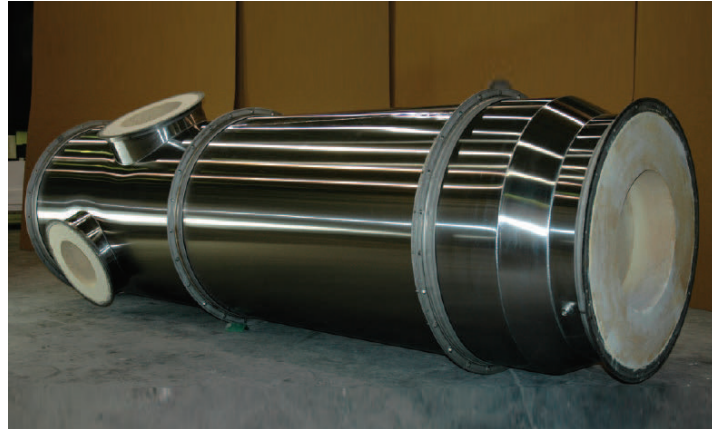
Vertical afterburner body with 2300° F Vacuct® insulation, 36" ID x 52" OD x 176" L with 14-gauge 304 SS shell.