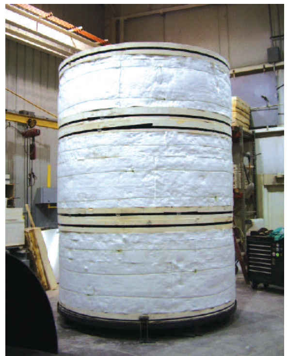
Catalyst activator system with 2300° F Vacuduct® and ceramic fiber blanket insulation system, 68" ID x 100" OD x 36' tall.