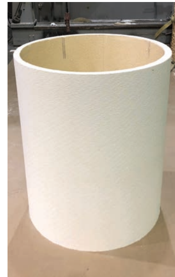
2300° F & 2600° F riser tubes 3"–60" ID and up to 60" tall.