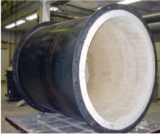
48" ID x 56" OD x 60" L carbon steel 2300° F Vacuct® section.